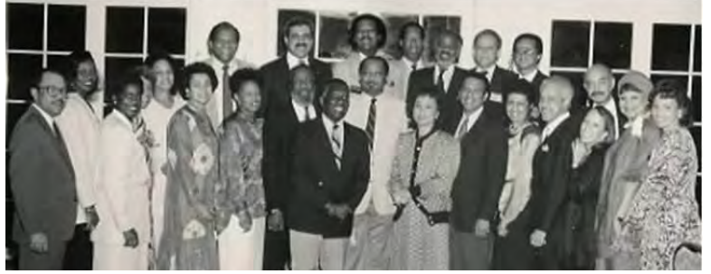
Early African American Leadership Family Retreat hosted by Arthur Ashe in Florida.

BEGINNINGS | Since 1985, a cadre of accomplished African American leaders called “ The Leadership Family ” banded together to empower one another, leverage their diversity, and to achieve extraordinary heights of excellence for themselves, their organizations, and communities.