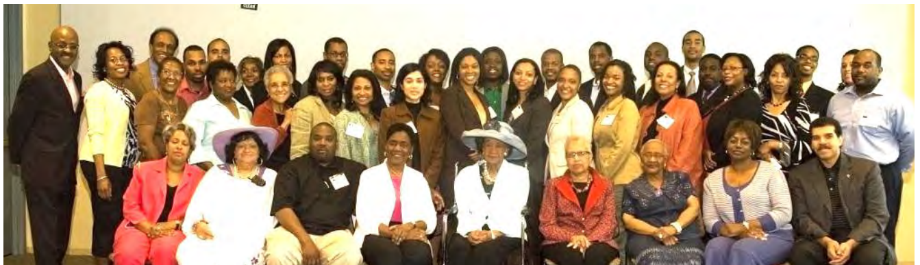
MSDL Faculty Team and MSDL I Fellows with Leadership Family members during 2008 inaugural session hosted at Microsoft.