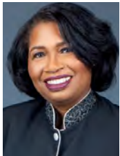
DR. LESLIE COPELAND-TUNE National Council of Churches of Christ in the U.S. Washington, DC Public Policy