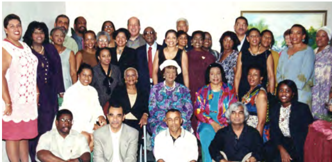
African American Leadership Family during a Leadership Retreat in Jamaica.