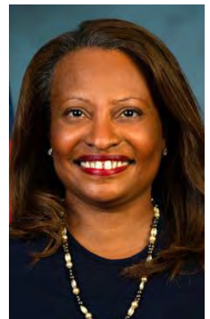
HON. ADRIANNE TODMAN MSDL Faculty Resource

THE HONORABLE ADRIANNE TODMAN leads the U.S. Department of Housing and Urban Development to create strong, sustainable, and inclusive communities with quality affordable homes for all. She is the Senior Official Performing the Duties of the Secretary and has served as the agency’s Deputy Secretary since her confirmation by the Senate in June, 2021. During her tenure at HUD, she has prioritized critical policy and operational priorities. Prior to joining HUD she served as the CEO of the National Association of Housing and Redevelopment Officials from 2017 to June 2021, where she advocated for funding and policies to preserve and develop affordable housing and help communities thrive. Todman also served as the Executive Director of the District of Columbia Housing Authority, where she implemented a national award-winning model to house veterans experiencing homelessness, increased homeownership opportunities by 50 percent for low- and moderate-income families served by DCHA, and increased the number of affordable units available in neighborhoods experiencing rapid growth. Her career in public service began in the office of then-Congressman Ron de Lugo, a long-serving member representing the U.S. Virgin Islands, where Todman was born and raised. She is a graduate of Smith College and lives in Washington, D.C.