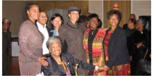
African American Leadership Family Members with the late Dr. Maya Angelou (seated).